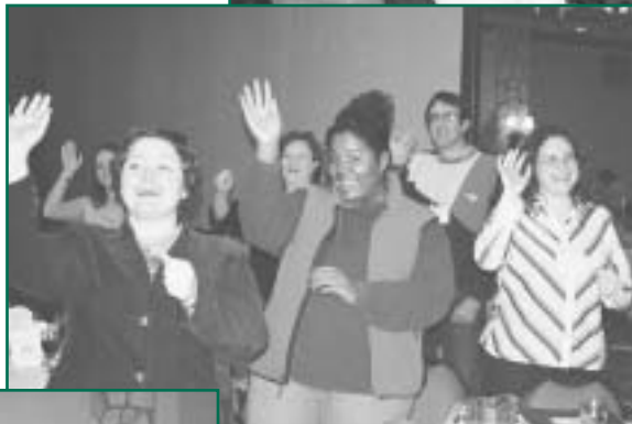
Conferees enjoy Saturday's Keynote and Luncheon