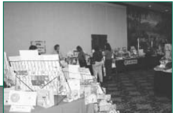
Conferees browse through the exhibits